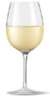
WHITE WINE (175ml): ABV 13% 2.3 UNITS