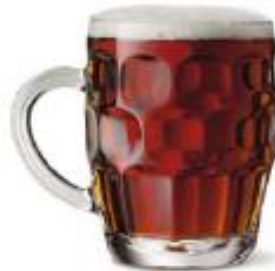
PINT BITTER: ABV 4% 2.3 UNITS