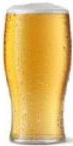
PINT LAGER: ABV 5.2% 3 UNITS